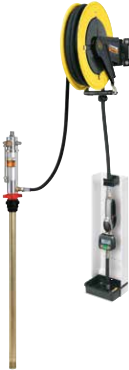
pump mounted on drum